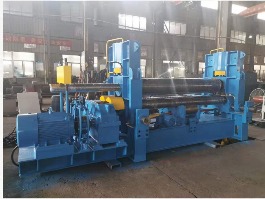
W11S ROLLING MACHINE